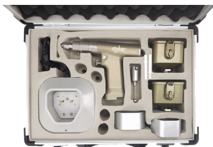
ST AC800 Aluminum case packing