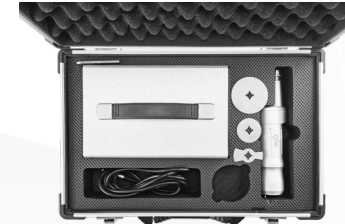
Aluminum case packing